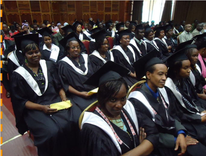
A Section of the graduates

Kapc Nairobi in November held a graduation ceremony for TOT, Diploma and Higher Diploma in Counselling studies at the KIE— Kenya Institute of Education.