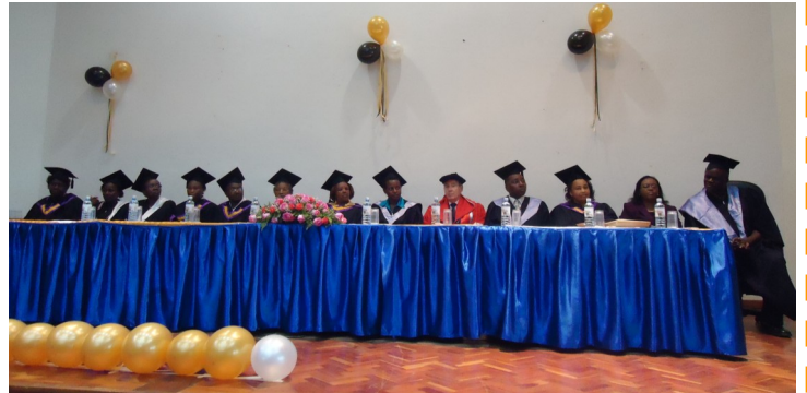
A section of the Tutors and KAPC management

Kapc Nairobi in November held a graduation ceremony for TOT, Diploma and Higher Diploma in Counselling studies at the KIE— Kenya Institute of Education.