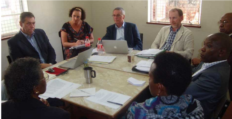
The University of Manchester Review Panel , together with KAPC Management.

The University of Manchester Review of Programmes Panel Report, 2010. 'The Panel congratulates KAPC on the support that staff gives to students. Students feel well supported on the programme and feel that staff are extremely approachable.' Report, 2010.